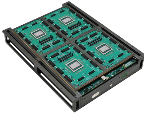
Figure 2: S2C S7-19PQ Logic System

GA interconnect, and to plug-and-play with the real-world through cables and daughter cards (S2C's "Prototype-Ready IP" or customer-designed daughter cards).