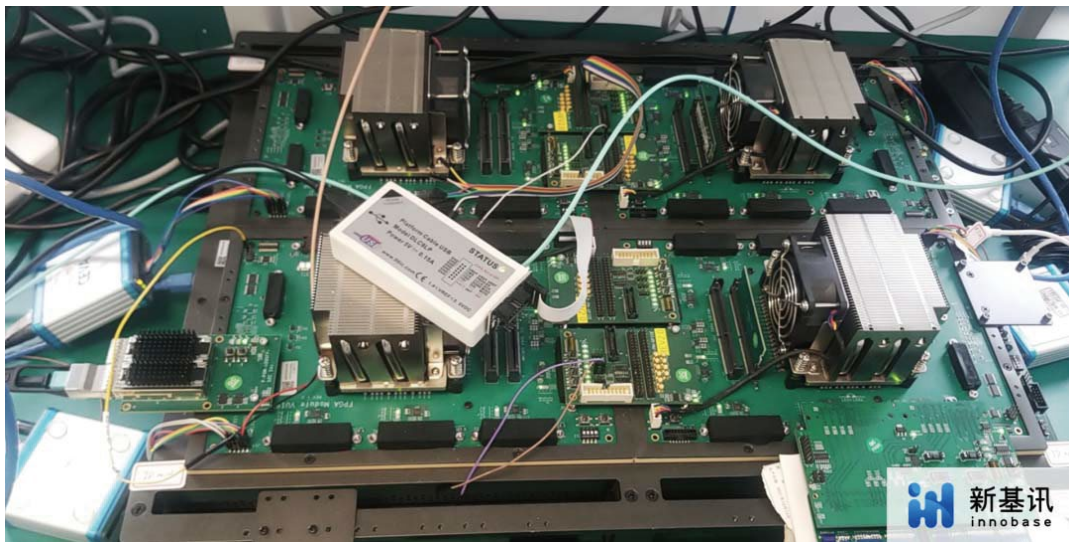
Figure 1: Innobase 5G SoC Verification Platform

Innobase's FPGA prototype platform was connected directly to bench-top instrumentation during SoC development to apply 5G communications traffic to the FPGA prototype at hardware speeds and confirm the correct operation of the communication system uplink, and board-level system operation of the 5G physical-layer functionality. With the addition of FPGA prototyping, Innobase was able to "shift-left" their chip development process to include early hardware/software co-development.