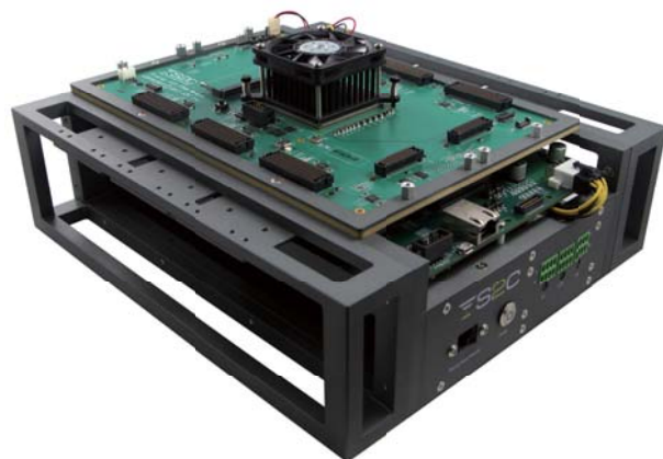
45 degree view of S10 2800 Enclosure System