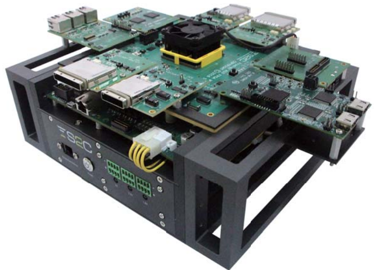
Single A10 1150 Prodigy Logic Module 45° View