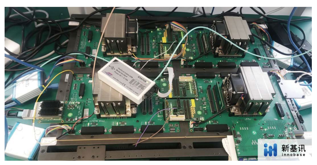
Figure 1: Innobase 5G SoC Verification Platform

Innobase's FPGA prototype platform was connected directly to bench-top instrumentation during SoC development to apply 5G communications traffic to the FPGA prototype at hardware speeds and confirm the correct operation of the communication system uplink, and board-level system operation of the 5G physical-layer functionality. With the addition of FPGA prototyping, Innobase was able to "shift-left" their chip development process to include early hardware/software co-development.